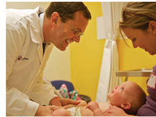
A typical day in the clinic

in the rotunda of the Russell Senate Building, and in the foyer of the Rayburn House Building in Washington, D.C., July 17 and 18. In addition, the exhibit will travel around the country for two years displaying at children's hospitals and partnering organizations in support of a wide variety of outreach efforts and events.